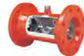
Turbine Flow Meter